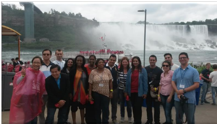
Toronto Centre participants at Niagara Falls, 2014

We strongly advise that you arrive the night before (Saturday, July 11 th ) if you would like to participate in the networking tour.