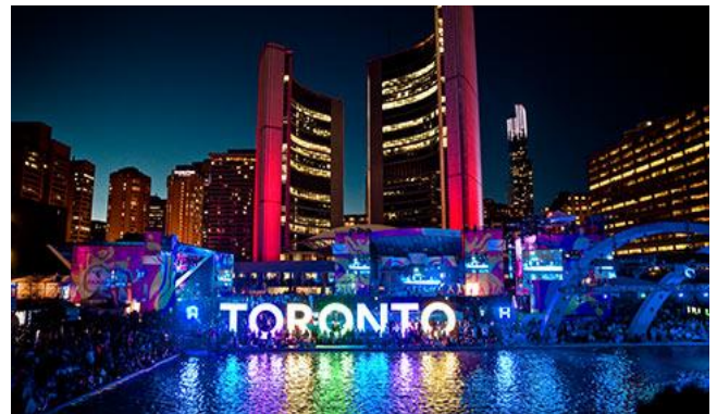
Toronto City Hall

Tourism Toronto is a detailed website outlining all the possible activities and tours that you can partake in.